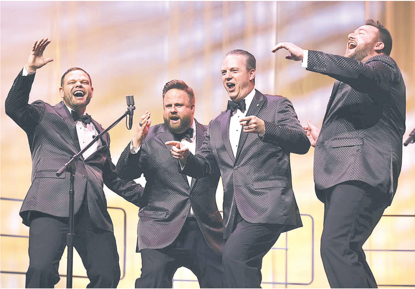
Quorum, the winners of the 2022 International Quartet Contest, will perform alongside three other barbershop quartets in “Spirit of the Season” at 3 and 7 p.m. Dec. 1 at The Sharon L. Morse Performing Arts Center.

International Quartet Contest, making the quartet the senior champions of the night.