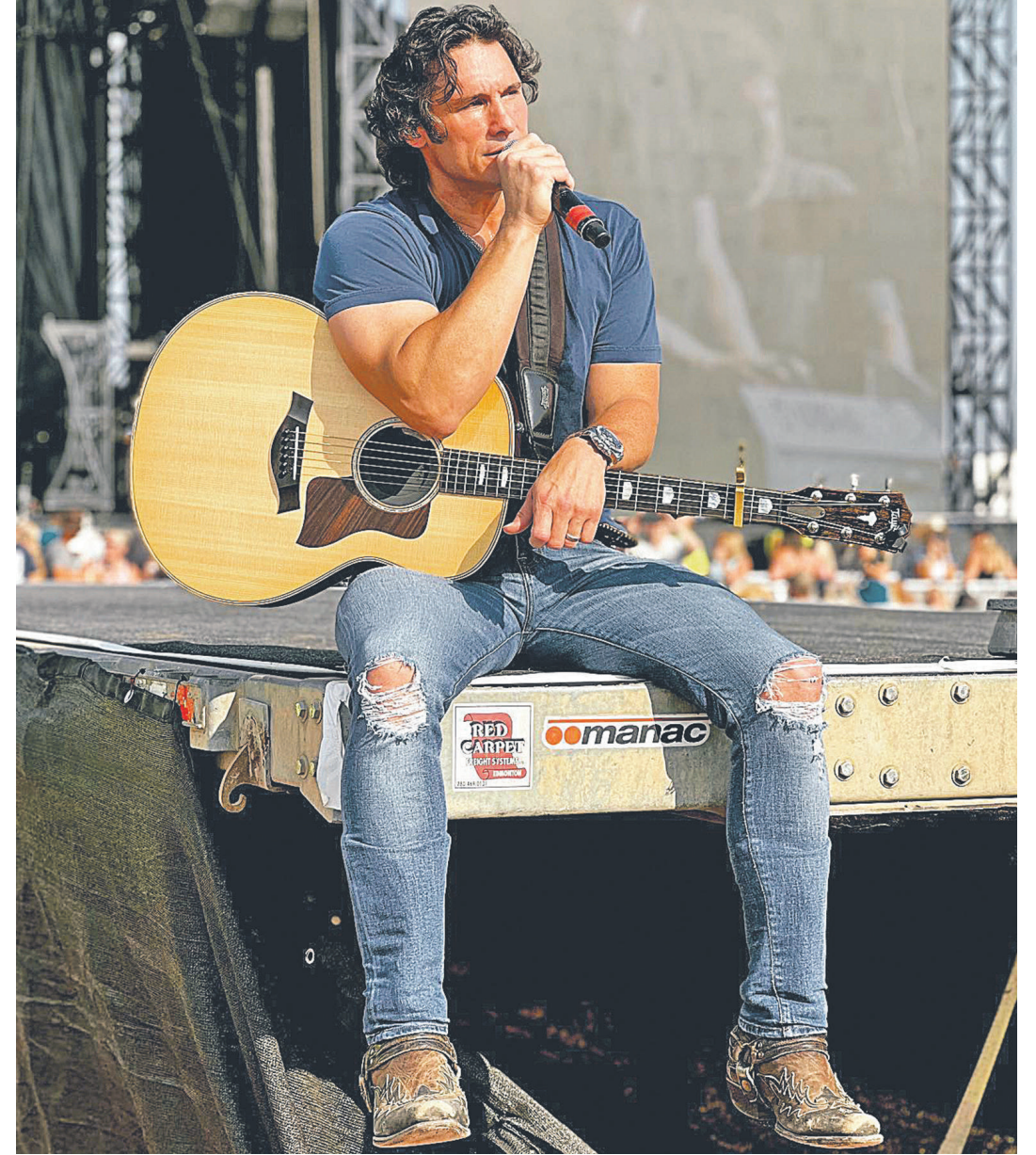
Country music star Joe Nichols is set to perform in The Villages at 7 p.m. Nov. 17 at The Sharon L. Morse Performing Arts Center.

Country music was one of 2023's fastest growing genres in the U.S., according to industry analytics platform Luminate, with country consistently ranking either third or fourth among current genre giants like world music and Latin.