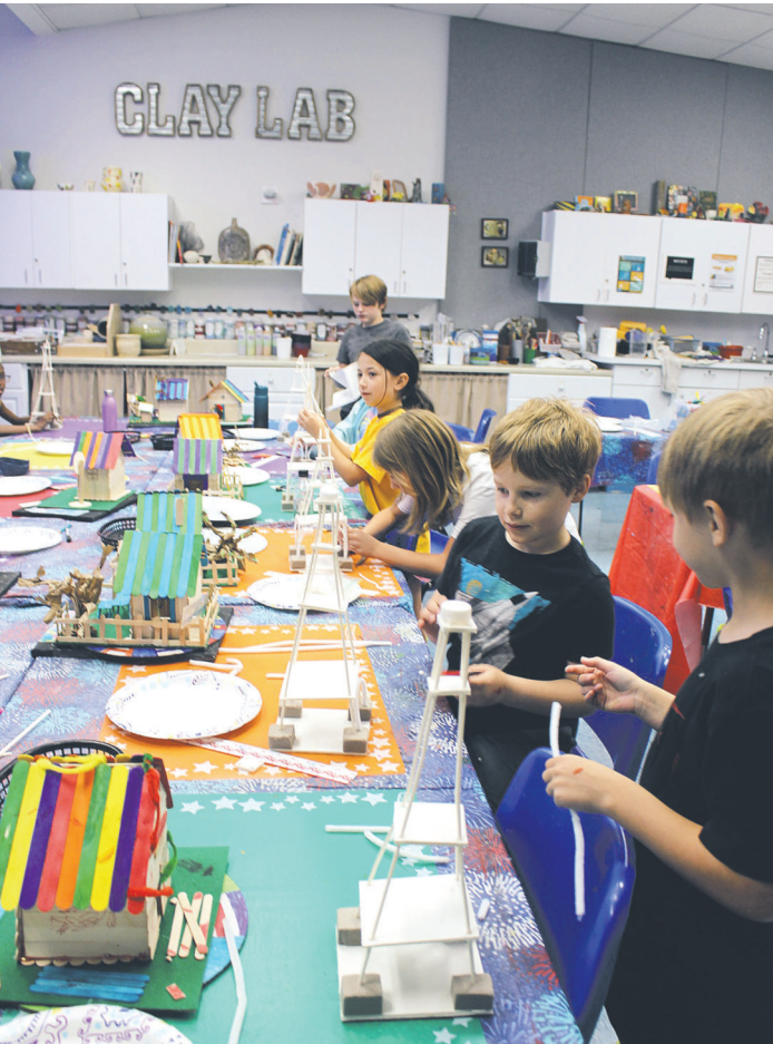
The Appleton Museum of Art’s annual Summer Art Camp program lets students learn about renowned artists, experiment with different mediums and use new techniques to create their own masterpieces.