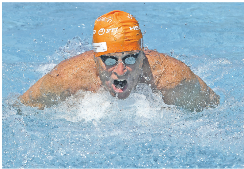
Sophia Lucente | Daily Sun