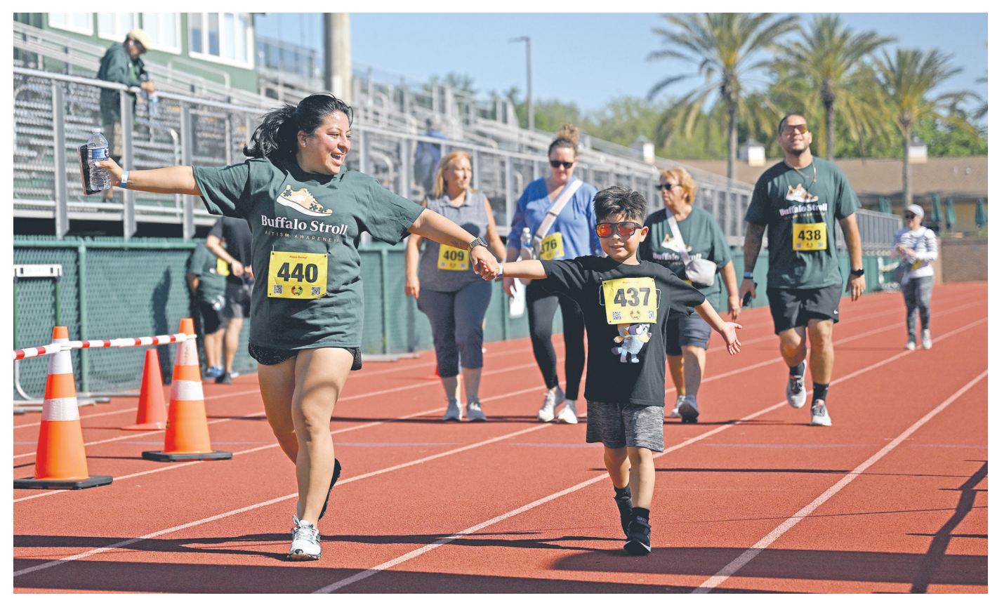
Sophia Lucente | Daily Sun